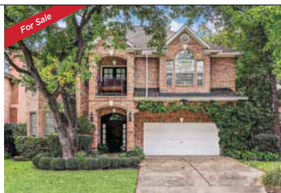
4510 BIRCH BELLAIRE | LP: $1,125,000