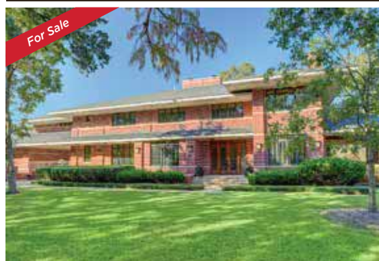
5208 BRAEBURN (Non MLS) BELLAIRE | LP: $4,395,000

Looking for a change? Let experience guide you with your next move. Cheryl Cooper, selling real estate for over 20 years in Houston’s close in neighborhoods.