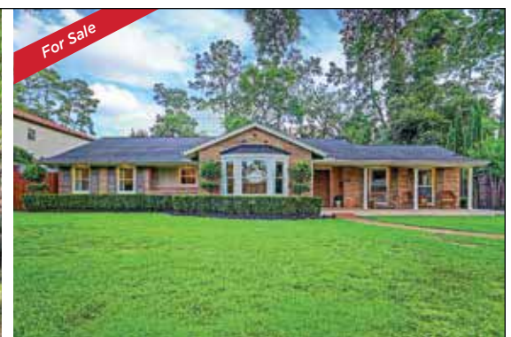
267 PINE HOLLOW PINE HOLLOW | LP: $1,450,000

Looking for a change? Let experience guide you with your next move. Cheryl Cooper, selling real estate for over 20 years in Houston’s close in neighborhoods.