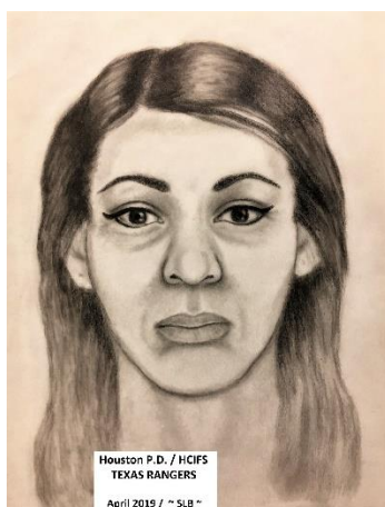
New sketch released of human head found in trash bag near Lake Houston.

The Texas Department of Public Safety released the new sketch of the woman on Friday after receiving a total reconstruction from the skull.